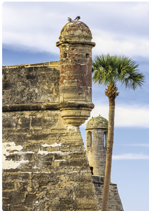
Castillo de San Marcos, St Augustine

Day 2 > Cross into Georgia before continuing north along the coast to historic Savannah. You're headed for Red Gate Campground, just 15 minutes from the city and featuring fishing ponds, bird watching, nature trails, horseback riding and a salt water swimming pool. Their website is full of interesting historic facts about Savannah, one of the true 'old south' cities. 📍 175 miles to Savannah