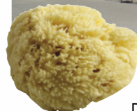
The Sponge Factory, Tarpon Springs

Day 11/12 > Interstate 4 to Disney Fort Wilderness Resort and Campground - for however many nights you wish to spend with Mickey Mouse. There is little we can say about him except that he's very old, married to Minnie, and between them they have built an empire that covers a lot of Central Florida! Not to be missed are EPCOT (Pub quiz question: What does this stand for? Answer: Experimental Prototype Community of Tomorrow) MGM Grand and Animal Kingdom as well as the Magic Kingdom itself. 📍 80 miles to Disney Fort Wilderness. 🌐 https://goo.gl/289iRB