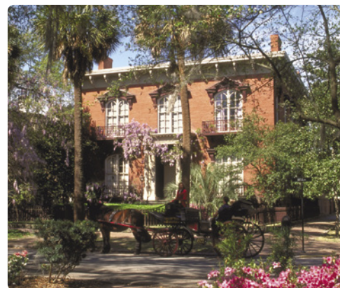
Mercer Home, Savannah

amazing vistas. 📍 280 miles to Lake Lure ★ Visit Lake Lure and spend time in the lake or take in Chimney Rock. 🌐 https://goo.gl/XEbLk3