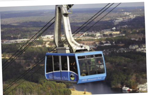
Stone Mountain cable car