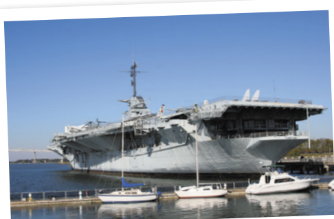
The USS Yorktown aircraft carrier, Charleston

★ Visit The Pirates House, the setting for parts of Robert Louis Stephenson's Treasure Island. 🌐 www.redgatecampground.com