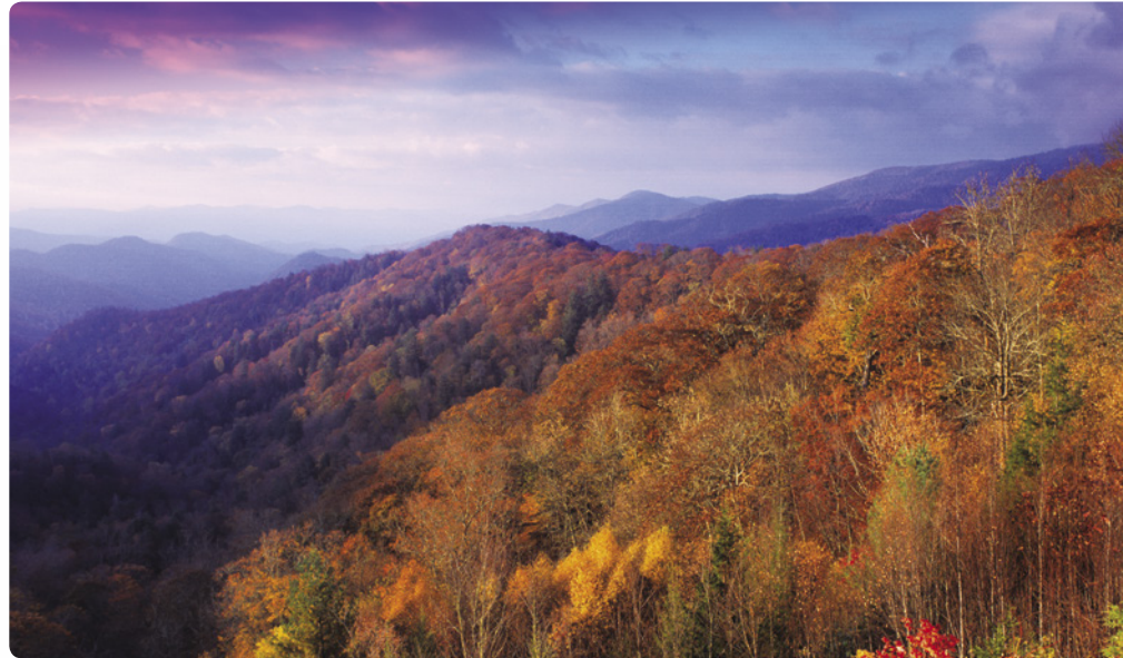
Newfound Gap, Great Smoky Mountains