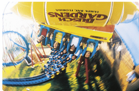
Busch Gardens, Tampa Bay