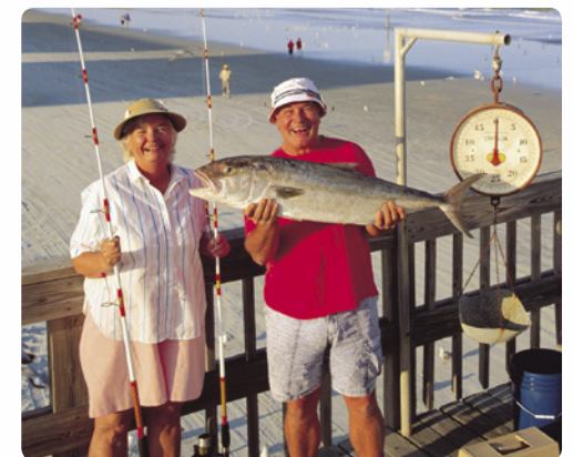
Fishing at Daytona Beach

Day 6/7 > Today make sure you make time to visit Asheville and the Biltmore Estate, the largest privately owned home in the USA, a truly amazing place. You are now heading towards the Great Smoky Mountains National Park area, world renowned for its diversity of plant and animal life, the beauty of its ancient mountains, and the