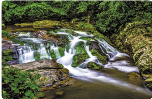
Mountain stream, Great Smoky Mountains

📍 91 miles to Cosby, Tennessee ★ Enjoy the wonderful hikes and magnificent scenic drives of the Great Smoky Mountains National Park. Complete your stay with a visit to Dollywood including Dolly Parton's Dixie Stampede Dinner show - Dinner never was so much fun!